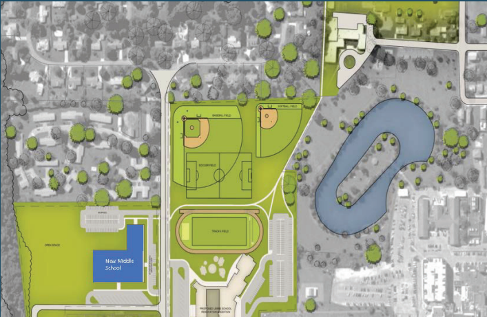
New Middle School

CHHS: July 2018 - July 2021 Middle School: July 2021 - July 2023 (pending State funding schedule)