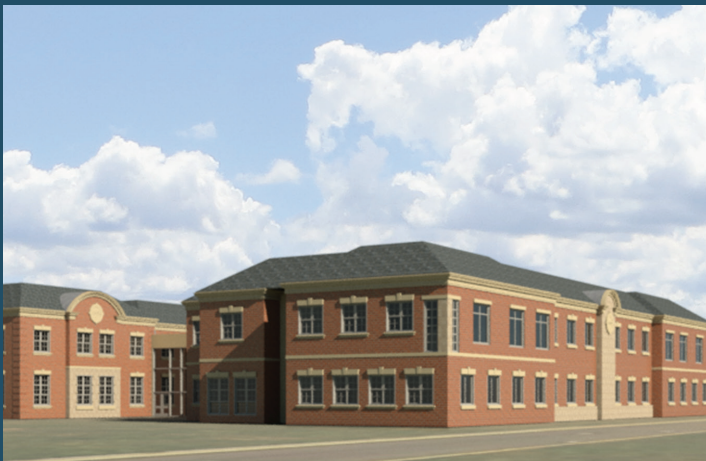
High School Addition